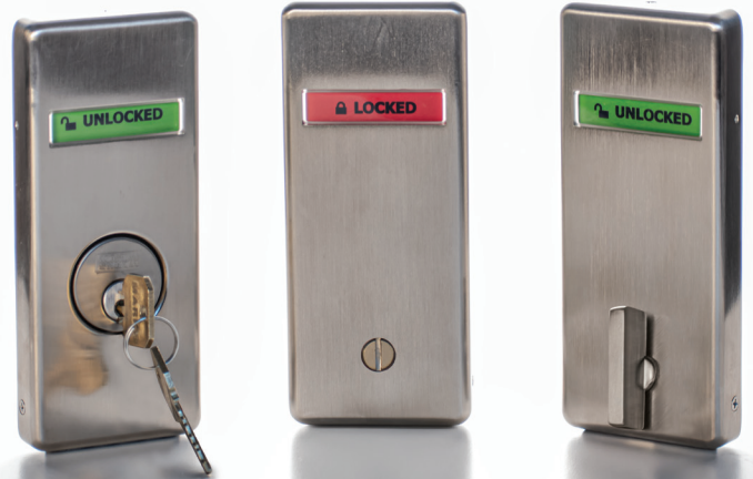
(shown left to right) Cylinder -CYL, Coin Key -CK & Turnpiece-TP models