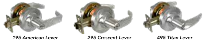
195 American Lever