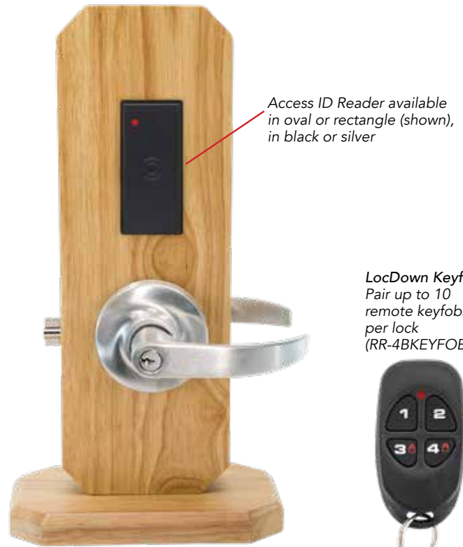
LocDown Keyfob: Pair up to 10 remote keyfobs per lock (RR-4BKEYFOB)

COMPLIANCES: ANSI/BHMA Grade 1 Certified, UL listed 3 hours