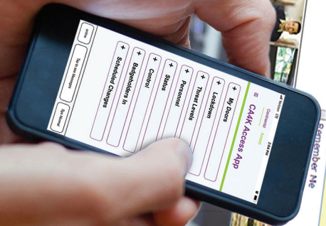
Door Control Hardware